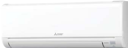
Indoor Unit: MSZ-GL09NA-U1